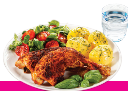
Kainga tōu pire xarelto 15 mirokaramu, 20 mirokaramu rānei me te kai